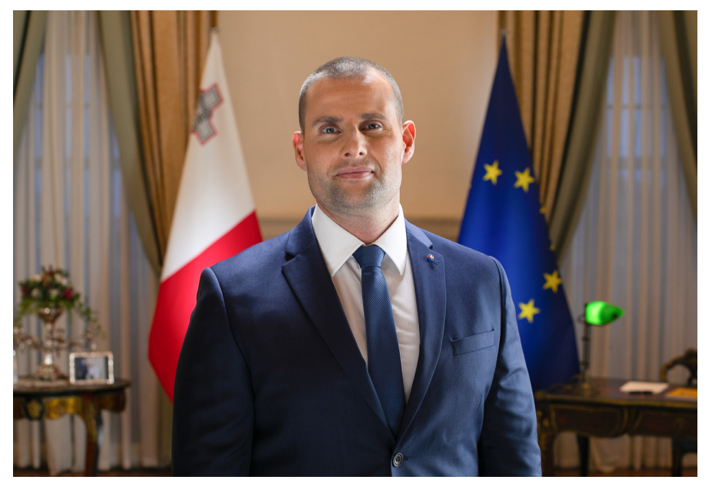
Prime Minister of Malta