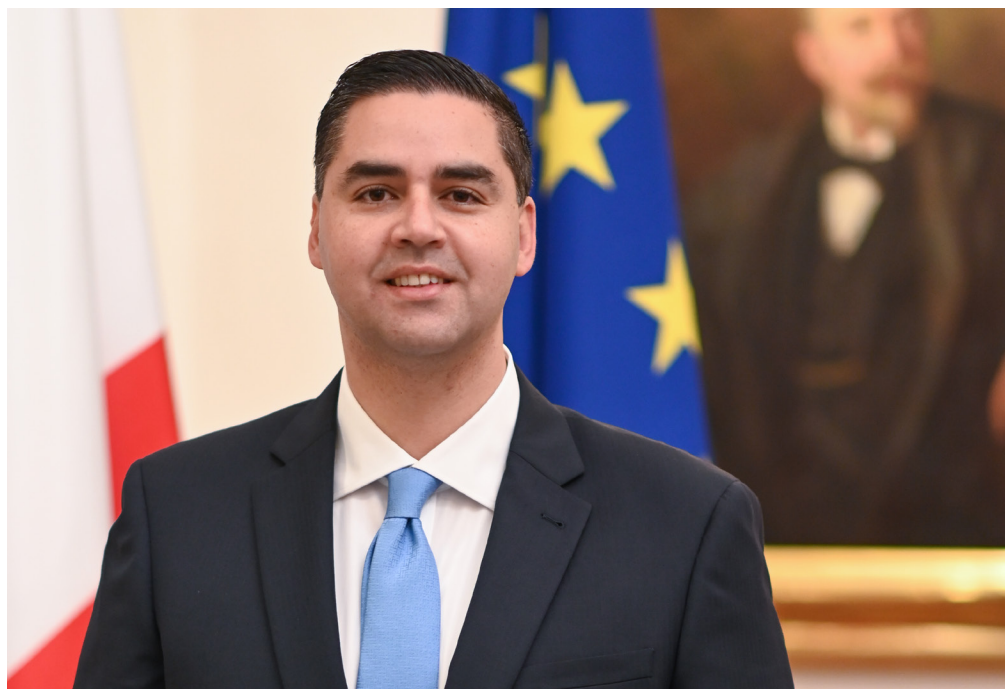
Minister for Foreign and European Affarts and Trade