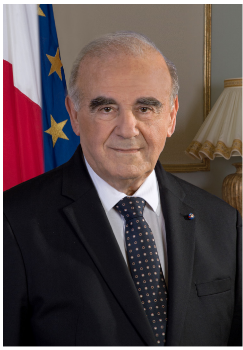
President of Malta

Through participation in the UN Security Council we could work with other Members towards the achievement of peace through